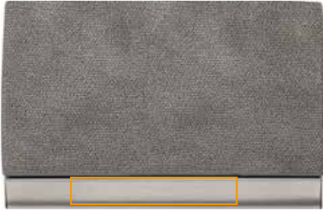
1. TOP SIDE