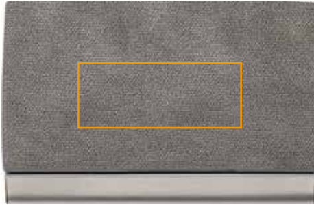
2. TOP SIDE