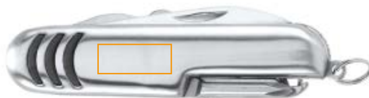
1. FRONT SIDE