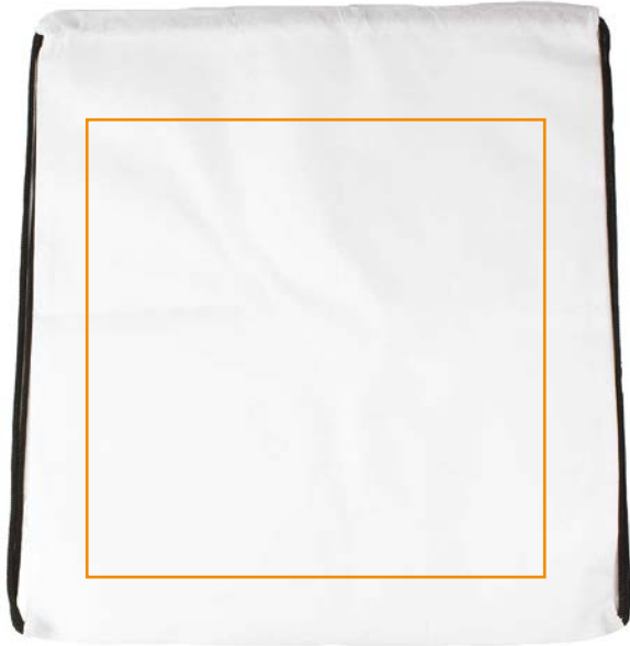
1. FRONT SIDE