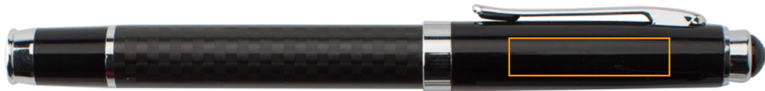
2. NEAR CLIP RIGHT HANDED