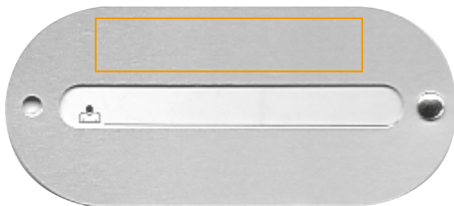
3. FRONT SIDE