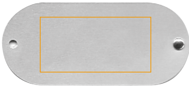
1 + 4. BACKSIDE