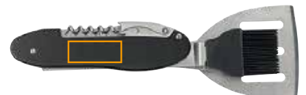
3 + 6. FRONT SIDE