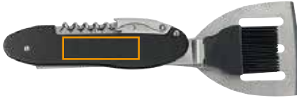
1. FRONT SIDE