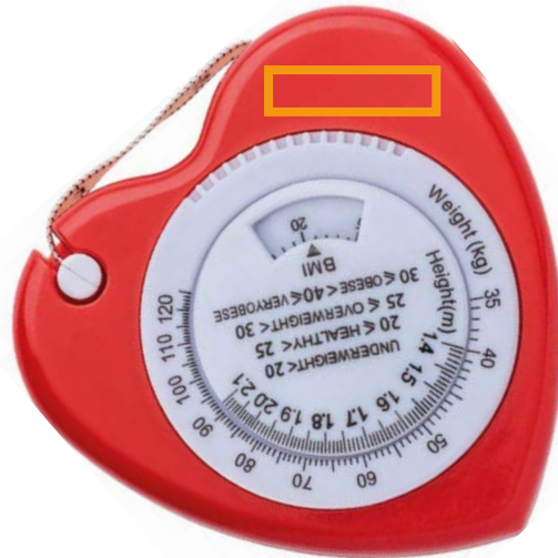
2. FRONT SIDE